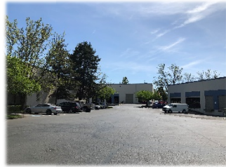
12817 NE Airport Way Building 7 15,025 SF 2,838 SF Office 4 Docks 1 Grade