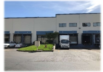
13151 NE Airport Way Building 14 9,118 SF 2,016 SF Office 2 Docks 3 Grades