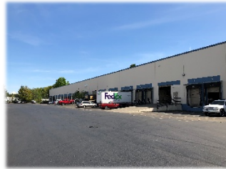
12841 NE Airport Way Building 9 3,574 SF 985 SF Office 2 Team Docks 1 Grade